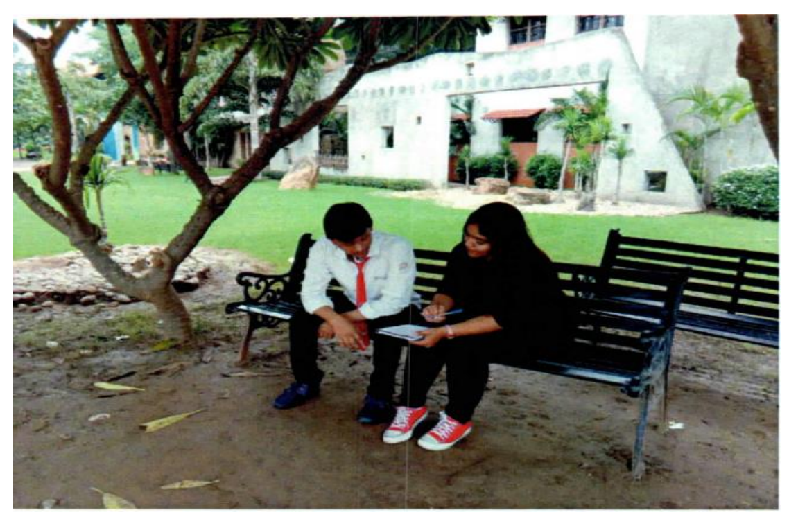
Ladies Club Head along with Publicity Club Head discussing the script