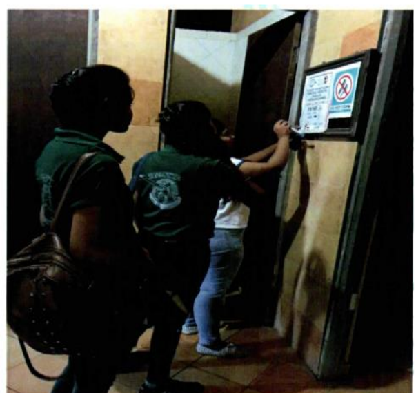
Instructive posters in Girl's Common Room