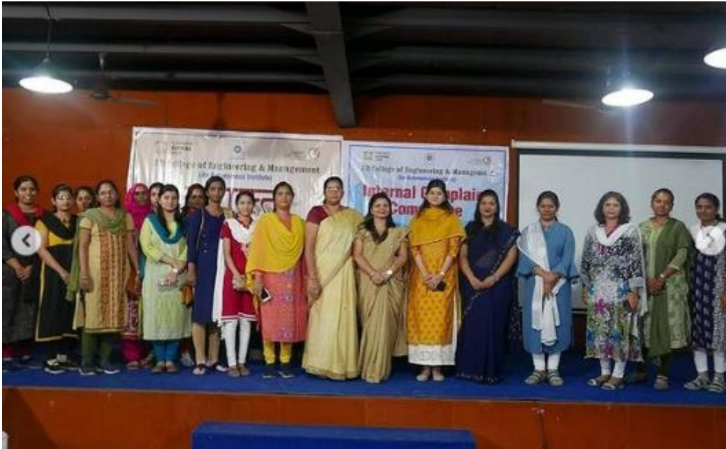
Group Photo of the Faculties with the Guest