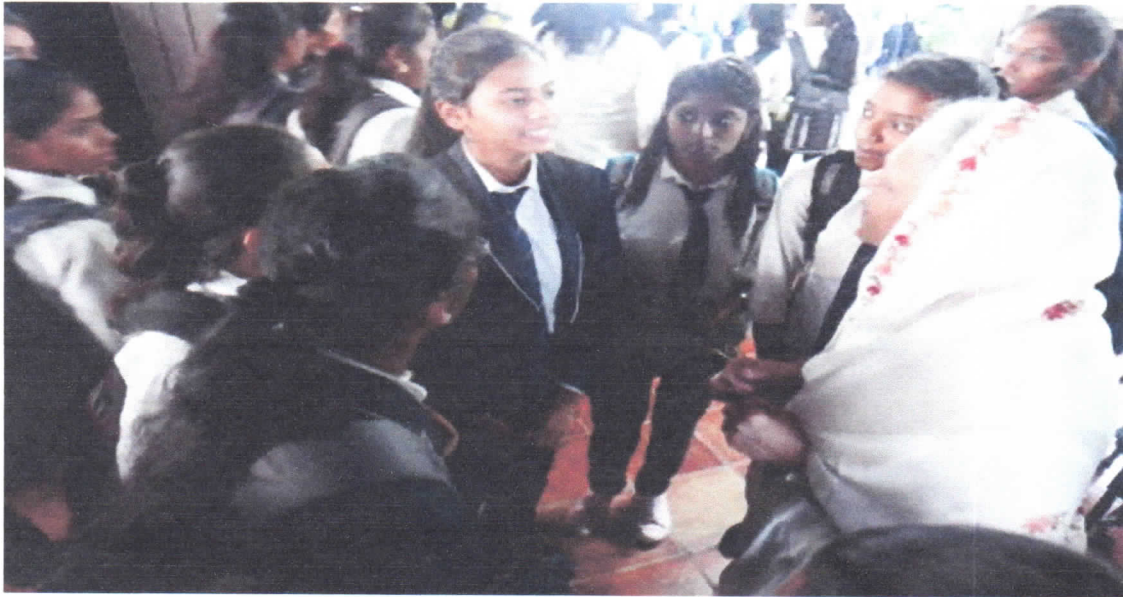
Students clarifying their doubts