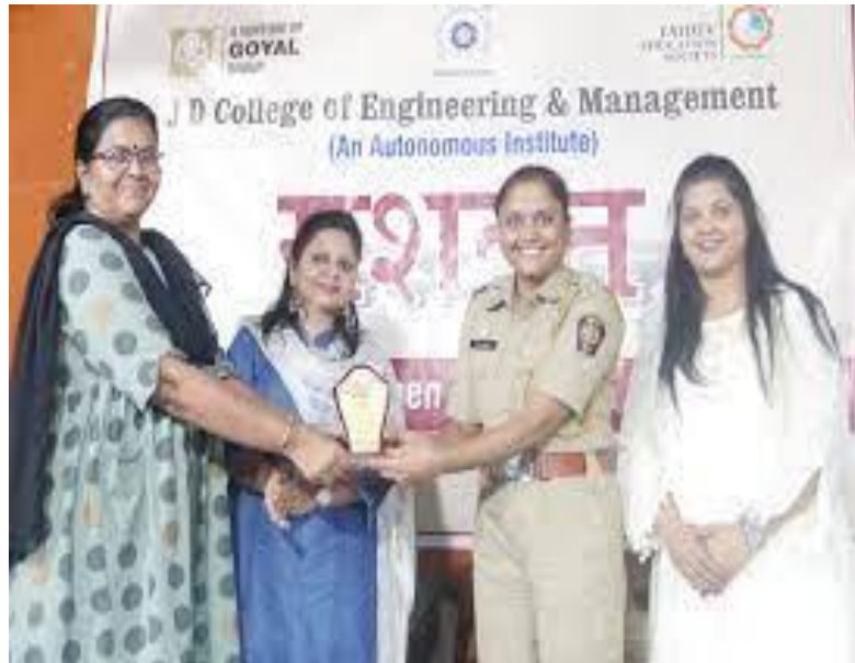
Memento presented to the Guest