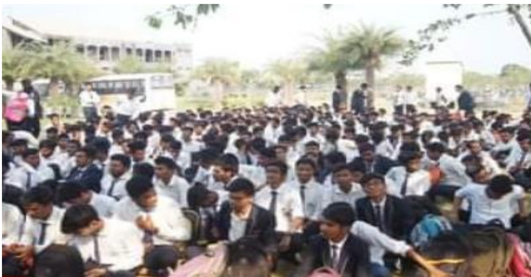
Students attentively listening to the speaker