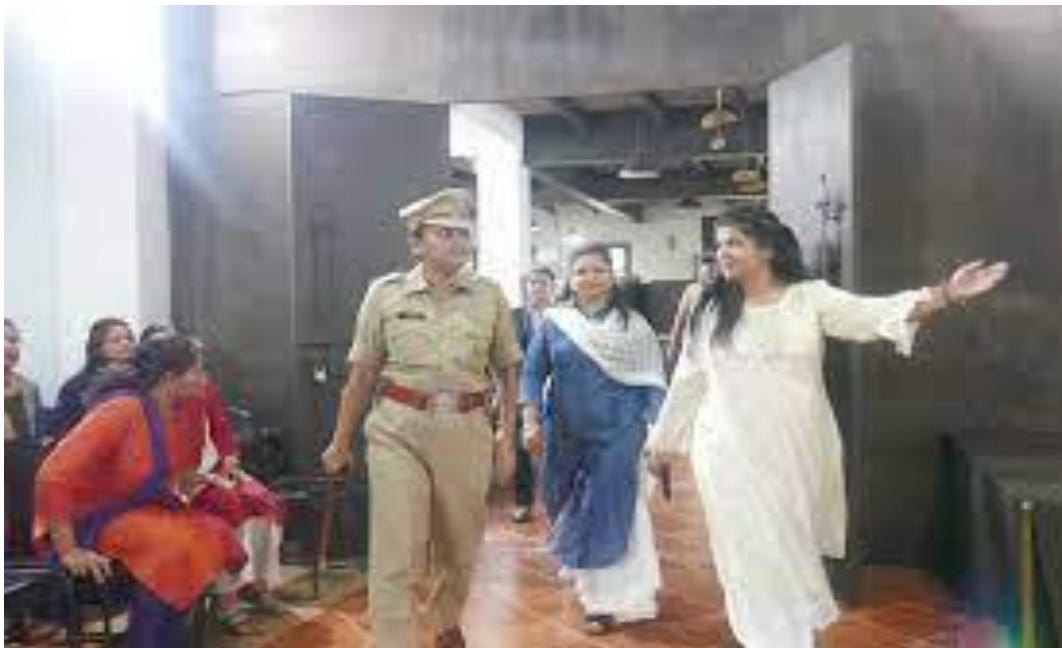
D.C.P Shweta Khedkar entering the Auditorium

On the occasion of Women's week, the Ladies club under Students Club conducted a workshop on Women's safety to create awareness among the girl students. The D.C.P, Nagpur, Ms. Shweta Khedkar was invited to conduct the workshop for the all girls, on the 3 rd March, 2020. The main purpose of conducting the workshop was to make girls aware of different security situations and how to deal with them. D.C.P Shweta Khedkar shared the different types of cases she comes across in her police career. Real life examples gave girl students new insight to be safe and alert. The key element of the talk was women's safety and security which is being threatened through cyber crime.