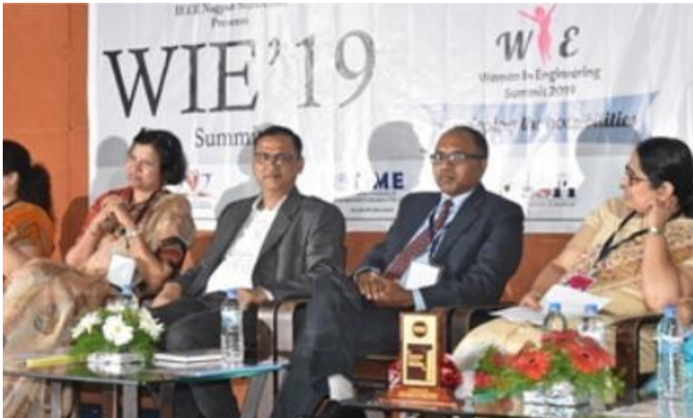
Dignitaries at the Inaugural Ceremony

'Women in Engineering' Summit was organized by J D College of Engineering & Management in association with IEEE in A P J Abdul Kalam Auditorium on 9 th September 2019. The aim of the event was to promote women engineers & recognize their special contribution in the field of Engineering. It was also aimed to create more awareness among the girl students with regard to their career in Engineering Science.