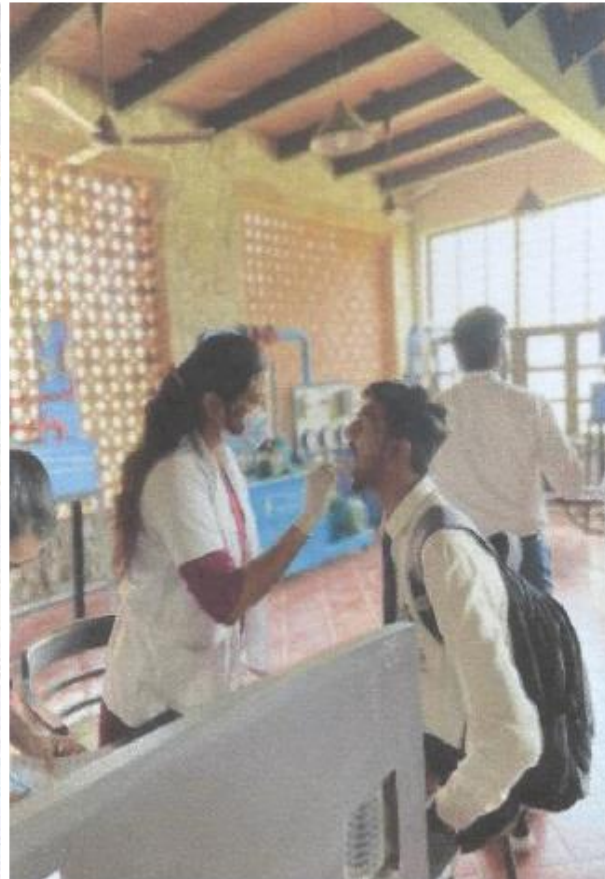
Doctor checking the student