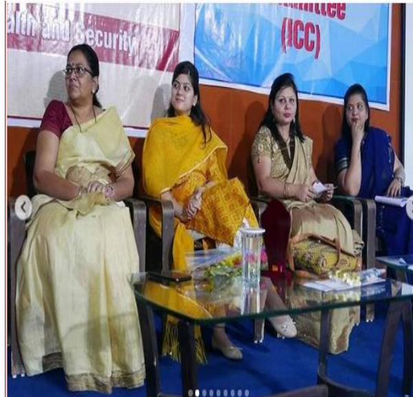
Expert during introduction