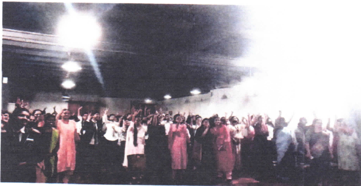
Participants taking a pledge of Healthy Diet

On the occasion of Women's day, the Ladies club under Students Club conducted a workshop on 'Healthy Diet Plan' for the students and staff, on the 5th of March, 2020. The purpose of conducting this workshop was to make people aware of healthy diet and motivate the students to stay fit. Ms. Shital Kaduand exhorted the importance of a balanced diet in a person's life and called upon the student community to imbibe the practice of eating nutritious food.