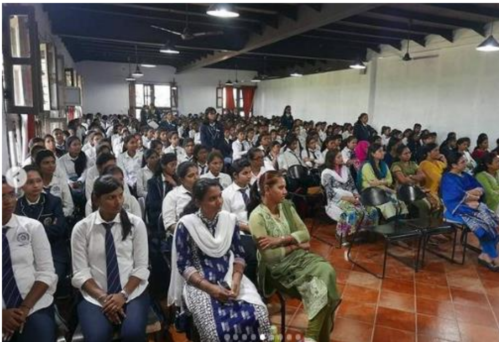
Audience in the session