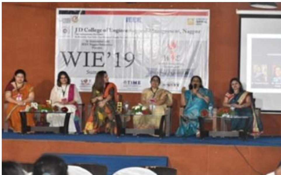
Panel Discussion Experts at WIE Summit