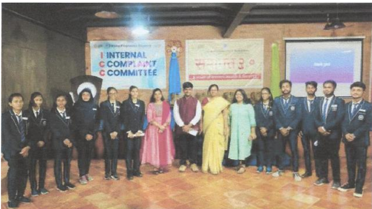
Organizing Committee Members with the Guest