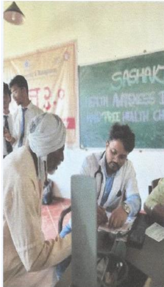
Medical Examination in progress