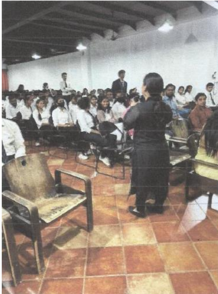
Students asking their doubts