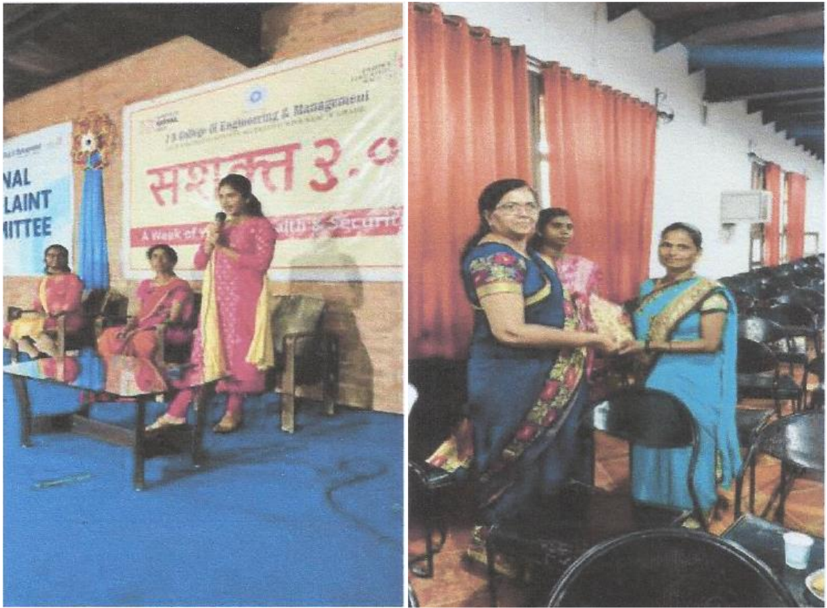
Felicitation of the Non Teaching Staff