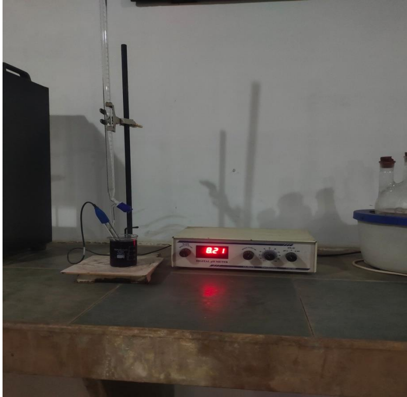
Chemical waste neutralization in Chemistry Lab

Hazardous chemicals are not used in the laboratories. Acids in diluted form are used in engineering chemistry laboratory, which are discharged directly. When necessity arises to utilize a strong acid or base, they are neutralized before discharging. No radioactive elements of any form are used in the campus and thus its waste is not generated in the campus.