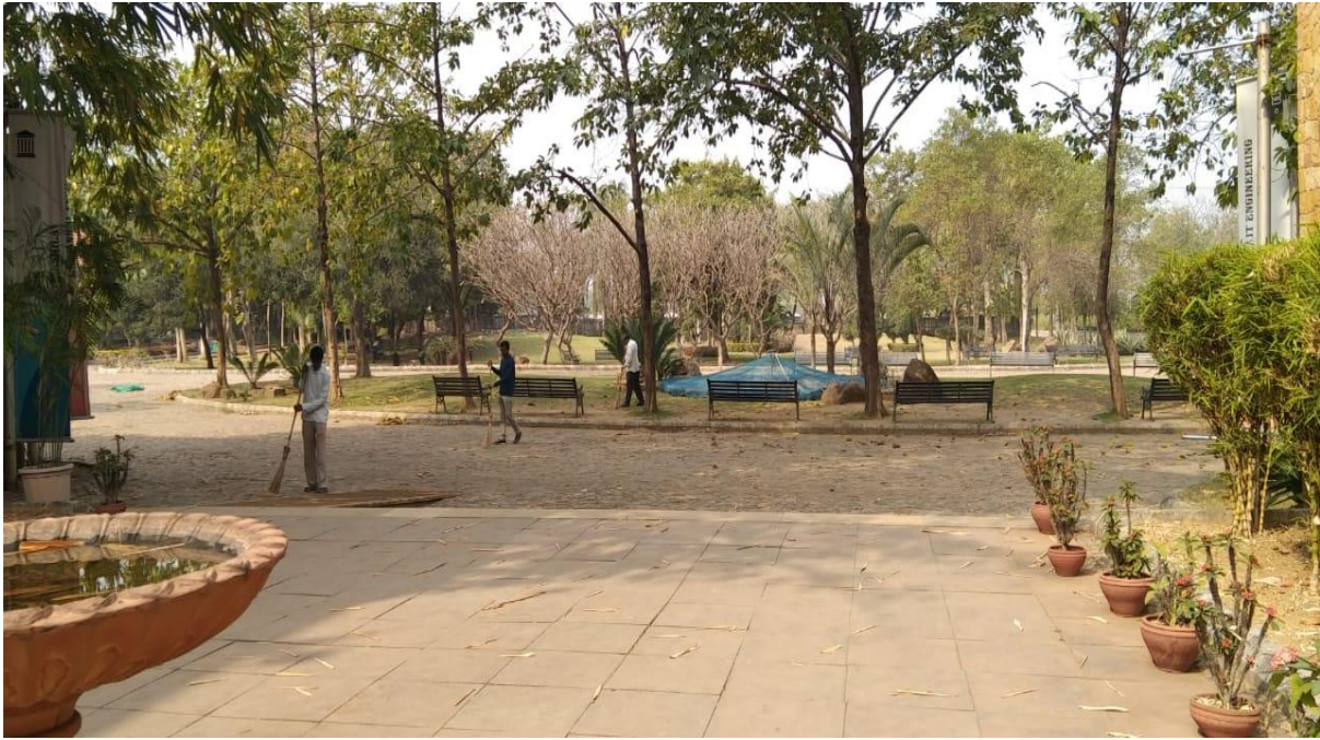
Cleaning staff at their duty