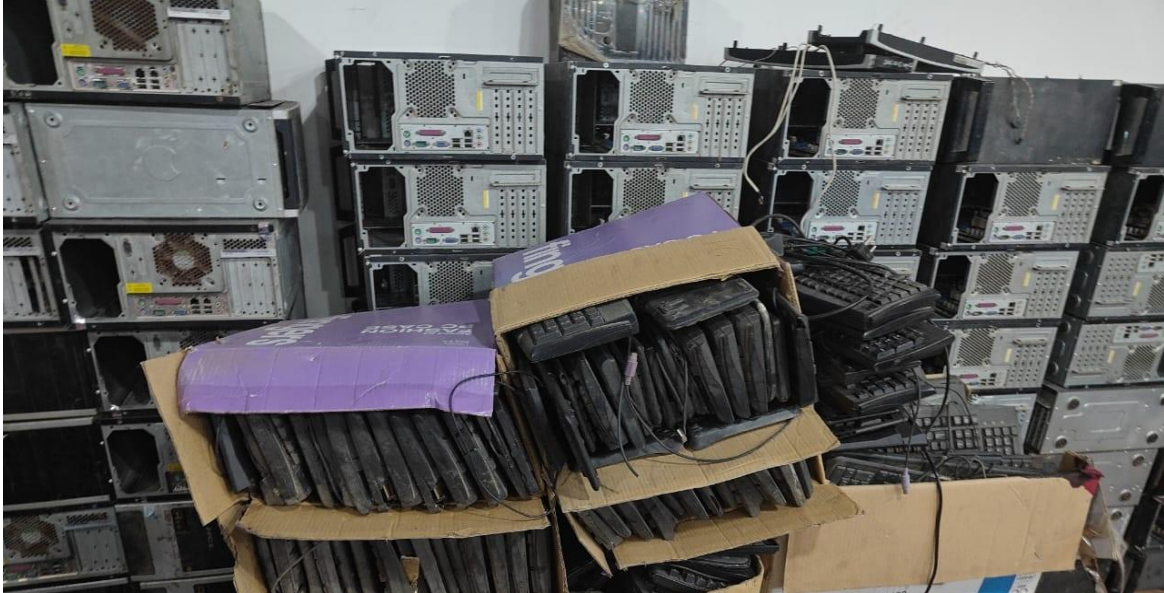
E waste in the campus

E-waste or electronic waste is created when an electronic product is discarded after the end of its useful life. E-waste mainly includes obsolete electronic devices, such as computer systems, servers, monitors, compact discs (CDs), printers, scanners, copiers, calculators, fax machines, battery cells etc. E-waste is disposed off through vendors.