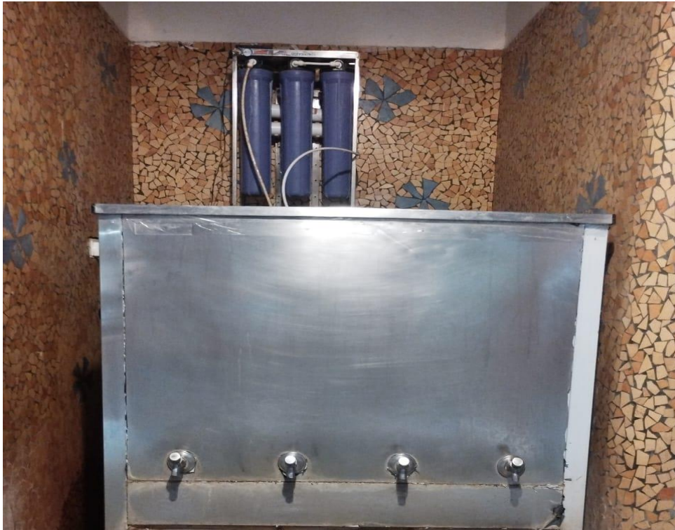
RO Filters installed near water coolers