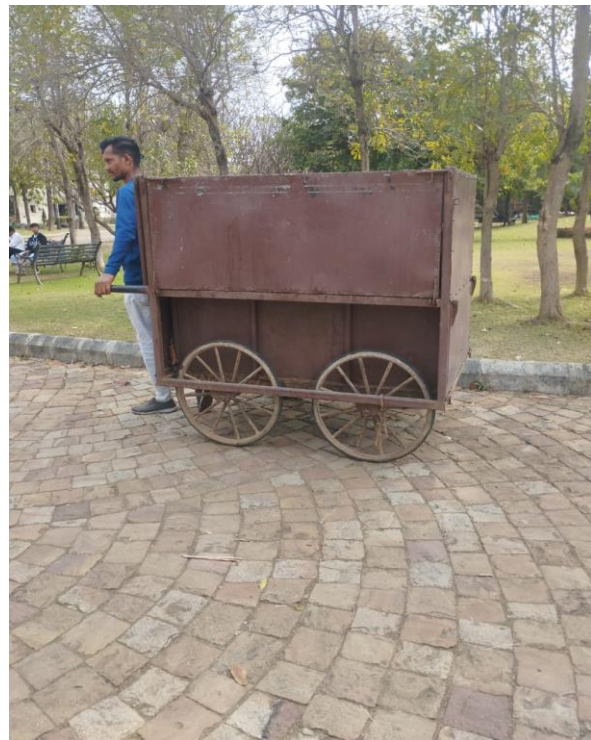
Solid waste being collected in the campus