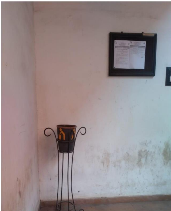
Dustbins in the premises

Waste collection bins are available on every floor in the academic, administrative buildings & laboratories. Campus is cleaned daily by the cleaning staff under the supervision of Cleaning & maintenance in charge. There are separate bins for bio degradable and non bio degradable waste. The bio degradable waste includes leaves from the garden area, vegetable peels and food wastages from the canteen. The bio degradable waste is disposed off into the dumping yard especially designated for the purpose, from where it is transferred to compost pits for formation of manure. The non bio degradable waste includes paper which is sold to vendors for recycling.