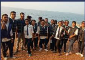
Eco Club Khindsi Visit