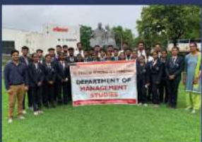
Lokmat Press Visit