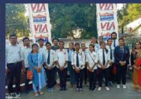
Visit to Udyojika