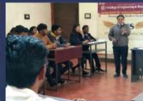
Activity Based Teaching Learning