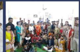
CSR Visit to Bal Sadan Orphanage