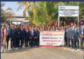
Visit to Unitech